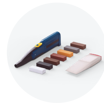
Repair kit QSREPAIR