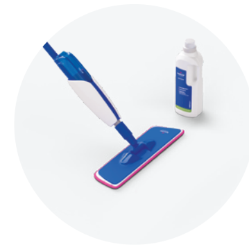
Cleaning kit QSSPRAYKIT