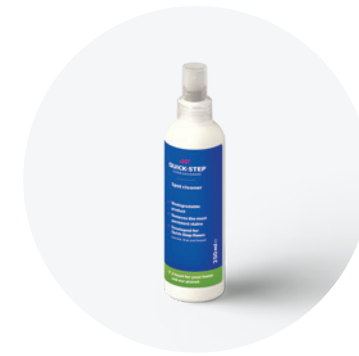
Spot cleaner 250 ML QSSPOTCLEAN