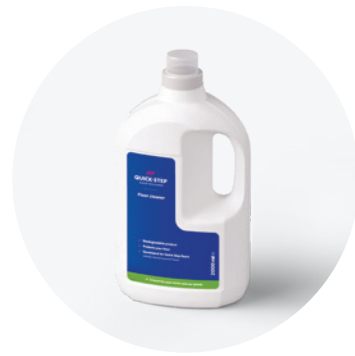
Floor cleaner 1 L or 2 L QSCLEANECO1000 QSCLEANECO2000